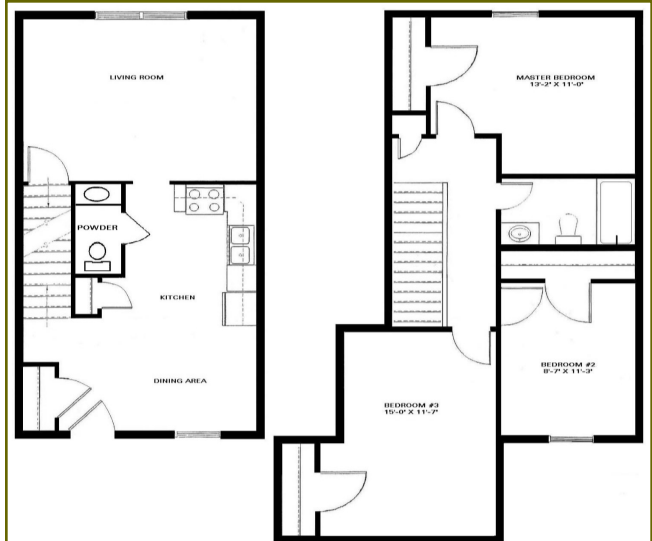
3 Bedroom—1 1/2 Baths with Basement

Main Office 536 Bay Road Suite 2 Queensbury, NY 12804 Phone: 518-798-0674 Fax: 518-743-9653 After Hours: 518-361-9164 www.schermerhornholdings.com Email: info@schmerhornholdings.com